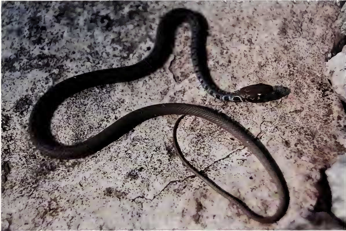
Adult Coluber atayevi .